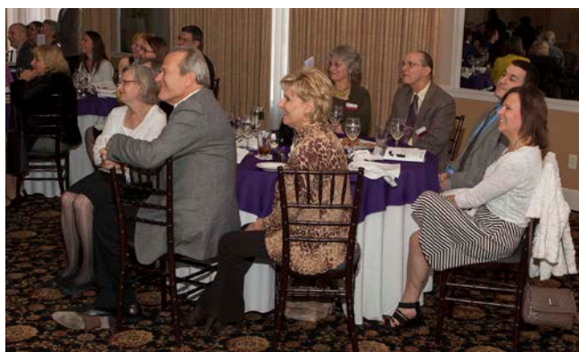
Inductees and guests enjoying the presentation.