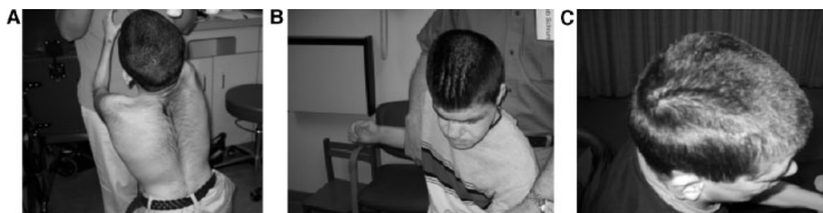
Figure 4. A: Marked hypertrichosis on the back of a 20-year-old patient. Cutis verticis gyrata in two unrelated male patients in (B,C).

Self-injury was present in 59% of the patients, with aggression in 37%. Attention deficit disorder with or without hyperactivity was noted in 20%. There was a roaming type of behavior in 35%, in which the individuals would not sit still, and wanted to roam constantly around the room. All of these individuals had moderate-severe to severe MR with absent speech. Anxiety was diagnosed in 33% and depression in 11% of the patients. Fifteen percent demonstrated obsessive-compulsive tendencies, and two patients had obsessive-compulsive disorder. Seven percent were found to have oppositional defiant disorder. Forty percent had autistic-like behaviors and 40% had quiet, shy, and retiring behavior. Of the several with normal or borderline intelligence, who also had learning disabilities, two have had substance abuse issues (alcohol in both, one with marijuana). A number of medications were used for behavioral issues including: Risperdal, Wellbutrin, Clonidine, selective serotonin reuptake inhibitors (e.g. Prozac), neuroleptics