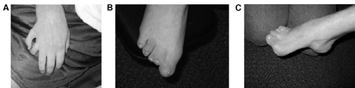
Figure 3. Extremity findings. Note unusual presentation of postaxial polydactyly in (A) and of complete syndactyly of toes 1–3 in (B). Unrepaired club foot, as in (C), was seen in several patients.

Most patients (89%) were ambulatory; the remainder were able to walk with assistance and/or able to roll. Delayed skeletal maturity was noted in 10% of the patients. Orthopedic procedures were performed on 36% of the patients. Twenty percent of the patients reported fractures (clavicle,